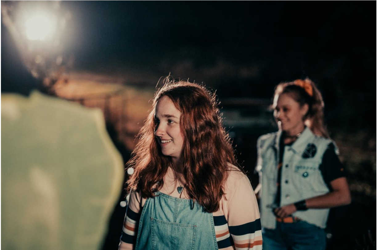
Behind the scenes of Sophie's Turn.

B: Last year as a whole, I think. 2017 was a really good year! I won my first lot of acting awards with my role in Sophie's Turn , and was acknowledged at the Australian Screen Industry Network Awards which was pretty cool. The awards were peer-nominated so to win an award there was a really exciting moment for me. Also, I graduated from my learners driving permit, so I can drive a car by myself now and I'm loving it!