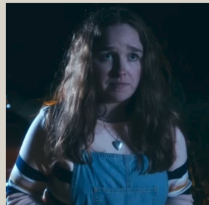
Tragic villainess Sophie

The vines suddenly disappeared, however, when Michelle (who had become alarmed by Sophie's screams) turned on the car headlights and revved the engine. But as Sophie headed back towards the car, a malevolent voice whispered to Sophie as she tucked the knife into her back pocket, hinting at her villainous transformation. When Sophie got back to her friends and Katy began to mock Sophie, the teen suddenly transformed into a demon, revealing that she had become possessed by the entity that attacked her. Sophie then proceeded to kill Katy by breaking her neck before using the knife to stab Michelle to death. After committing the murders, the possessed villainess got into the car and drove away.